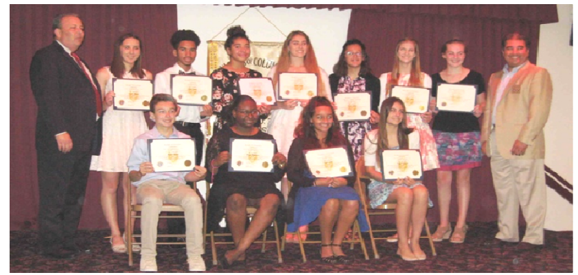
2017 Scholarship Recipients

The 2018 Scholarship Breakfast is coming to the Council Hall Sun June 10 following the 9:30am Quarterly Communion Mass at Visitation. This event is the culmination of the Knight's hard work all year to raise funds for deserving students!